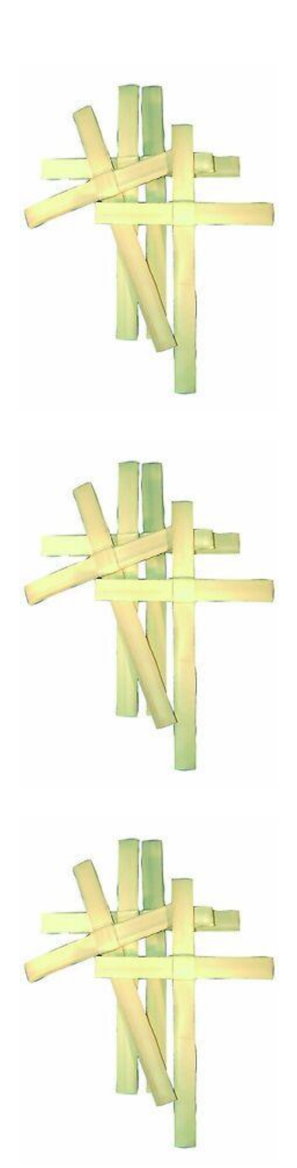
We may not be able to be in Church together, but we can hopefully join together through our own personal devotions, united by these words ...